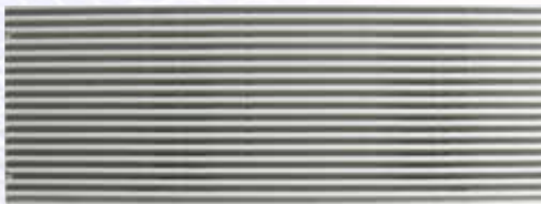
White: 7602-505 PWF