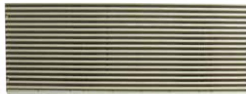
Beige: 7602-505 PBF