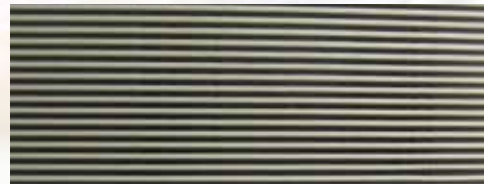
Alpine Beige: 7602-505 PAF