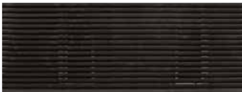
Dark Bronze: 7602-505 PDF